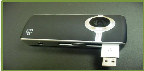
2. Pull down the switch to release the USB connector